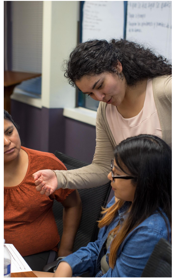
Juntos - College Access Program Workshop

AT&T Jefferson County Sheriff's Office Mexican Consulate Atlanta Raymond James Rubio Law Firm Total Skin and Beauty Youth Serve